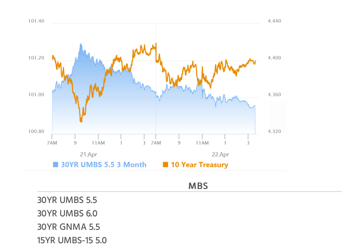
MBS & Treasury Markets