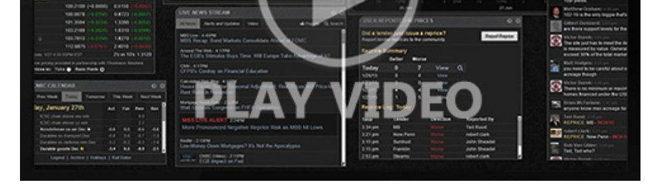
Watch the Video