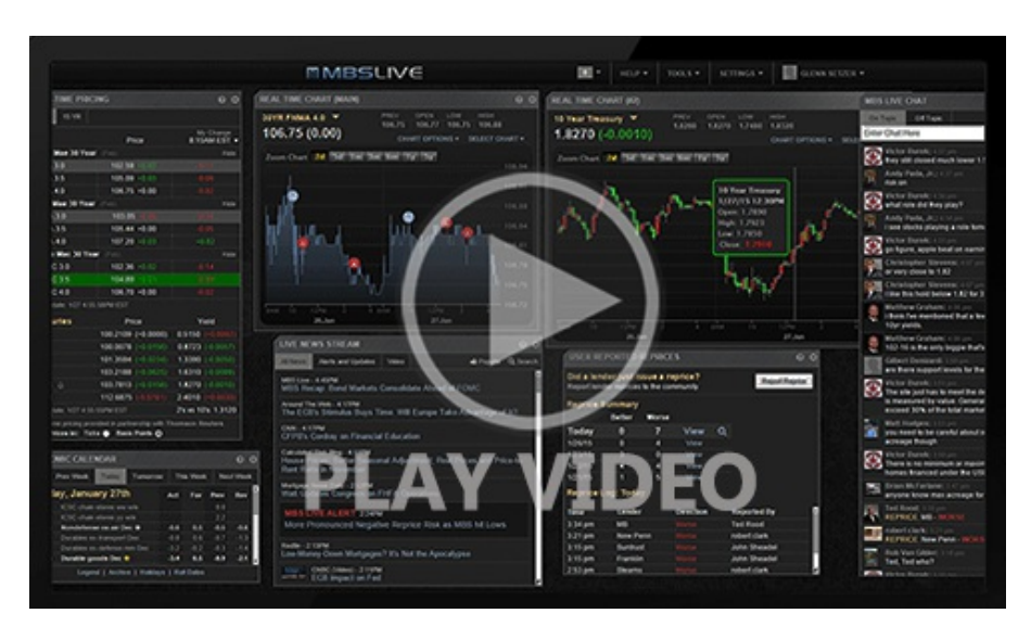
Watch the Video

Bonds were slightly weaker overnight but quickly moved into stronger territory as volume and liquidity ramped up for the new week. Gains were modest and linear--largely extending the friendly trends seen last Thu/Fri. The only key calendar event was the Treasury refunding estimates this afternoon. While there are some potentially alarming ways to read the newswires (i.e. "June borrowing estimates up to $514b vs $123b previously"), the large apparent change is due to accounting and not reflective of a $391 bln increase in spending or decrease in revenue. In other words, there were no whammies for the bond market. If anything, it was treated as good news based on yield movement at 3pm ET.