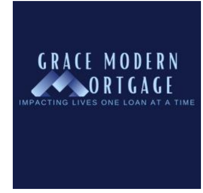
Grace Modern Mortgage

www.gracemodernmortgage.com P : (954) 945-8694