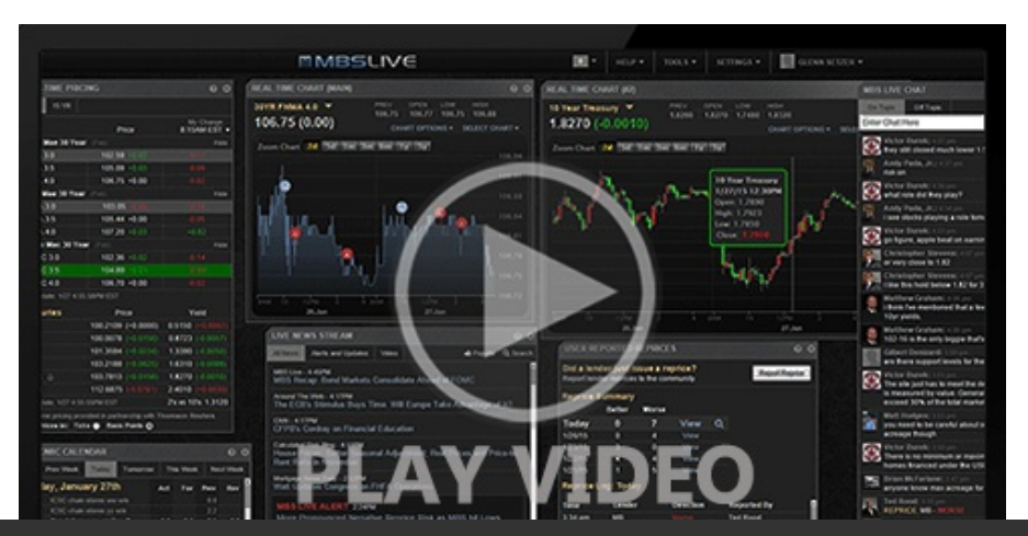
© MBS Live, LLC. All rights reserved. This newsletter is a service of MBS Live.

Today's ISM Manufacturing data played the role of coalmine canary today, and although it's not the most vigorous canary anyone's ever seen, it also wasn't dead. That wasn't good for bonds today as ISM is viewed as a good early indicator at times when the market is waiting for a certain shoe to drop (in this case, tariff/policy/uncertainty impact on econ data). ISM is also often heavily traded due to its proximity to the big jobs report (in this case, the following morning). If nothing else, the market's willingness to react to economic data once again is fully confirmed.