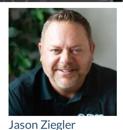
Owner & Mortgage Broker, Verasol Lending Solutions www.VerasolLendingSolutions.co

Taken together, Thursday and Friday completely erased the drop in Fed Funds Rate expectations over the preceding 6 trading days.