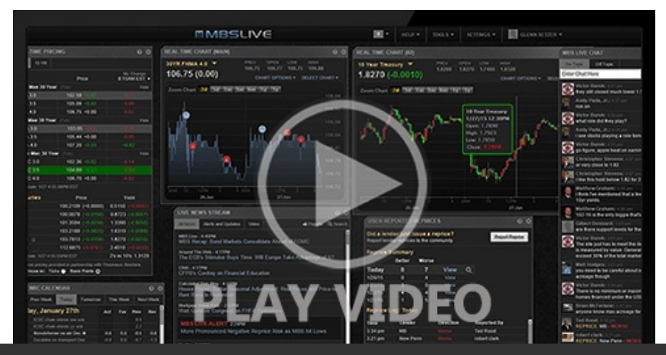
© MBS Live, LLC. All rights reserved. This newsletter is a service of MBS Live.

Bonds started weaker, flipped stronger mid-day, and then slowly moved back to unchanged levels by the close. Most of the day's volatility surrounded comments from a Swiss finance minister on this weekend's US/China trade talks (in Switzerland). The movement was very small in the bigger picture, possibly reflecting the very low odds for any sort of trade resolution like yesterday's UK/US deal. Still, over the weekend headlines may provide hints as to where the discussions are headed, and that could be worth some volatility as the coming week begins. A day later, CPI will provide the first big-picture assessment of April's inflation (still exceptionally early when it comes to potential tariff-related impacts, but not too early to see some impact).