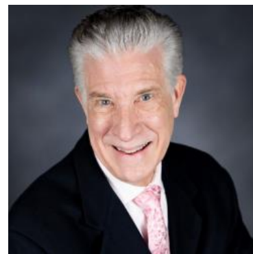
Senior Loan Consultant, CMG Home Loans

It's no secret that most measures of mortgage and housing activity have been operating in a low, narrow range compared to where they were a few years ago. The mortgage rate spike of 2022 gets most of the credit for that, and a longer term chart of refinance demand helps contextualize shorter term trends.