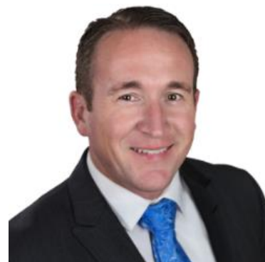
Loan Consultant, loanDepot

It's no secret that most measures of mortgage and housing activity have been operating in a low, narrow range compared to where they were a few years ago. The mortgage rate spike of 2022 gets most of the credit for that, and a longer term chart of refinance demand helps contextualize shorter term trends.