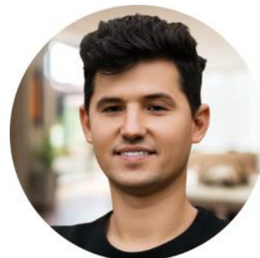
Mortgage Broker, Barrett Financial Group

It's no secret that most measures of mortgage and housing activity have been operating in a low, narrow range compared to where they were a few years ago. The mortgage rate spike of 2022 gets most of the credit for that, and a longer term chart of refinance demand helps contextualize shorter term trends.