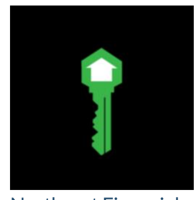
Northeast Financial LLC

www.northeast-mortgage.com P : (844) 788-7237