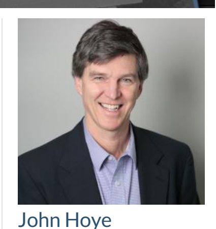
HoyeHomeTeam Berkshire Hathaway Agents www.hoyehometeam.com