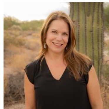
Residential and Commercial Mortgage Broker, NEXA Mortgage, LLC

It's no secret that most measures of mortgage and housing activity have been operating in a low, narrow range compared to where they were a few years ago. The mortgage rate spike of 2022 gets most of the credit for that, and a longer term chart of refinance demand helps contextualize shorter term trends.