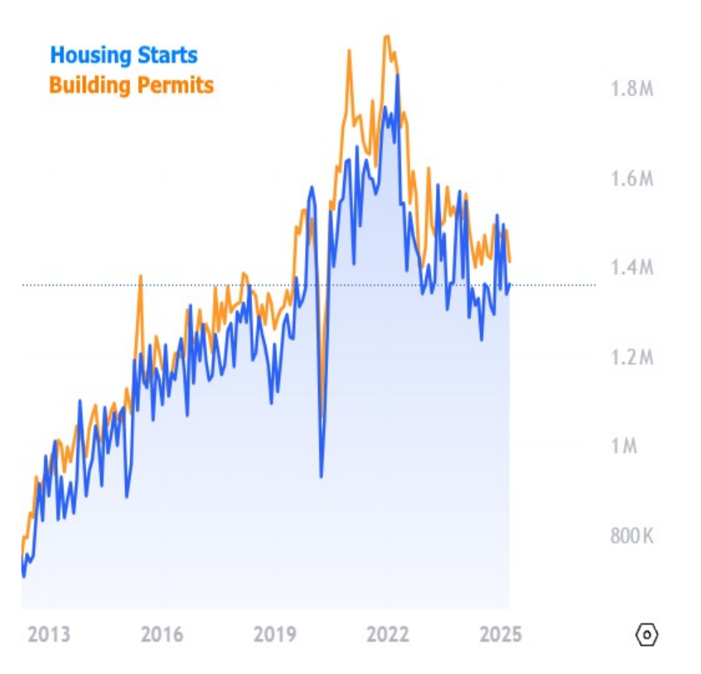
Nathaniel Rutkoski Mortgage Broker, Zoom Loans

As seen in the chart below, housing starts tend to be more volatile, month to month. In the present case, however, they were only slightly higher than the previous month at an annual pace of 1.361 million vs 1.339 million.