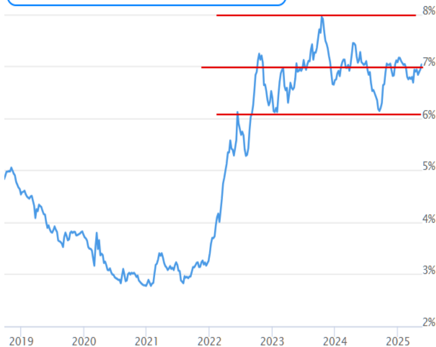
Mortgage News Daily 30yr Fixed Rate Index

The problem, for most people, is that it's been the middle of the road for far longer than anticipated. As has been and continues to be the case, there's not much incentive for a big improvement without 1 or more of the following 3 things: