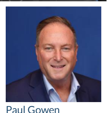
Broker/Owner, Willamette Falls Financial www.willamettefallsfinancial.com

P: (503) 922-1499 M: (503) 381-0736 4800 Meadows Rd