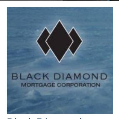
Black Diamond Mortgage Brokers, Black Diamond Mortgage Corporation

www.blackdiamondmortgage.com P: (406) 862-4999