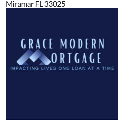
Grace Modern Mortgage

www.gracemodernmortgage.com P: (954) 945-8694 11820 Miramar Parkway