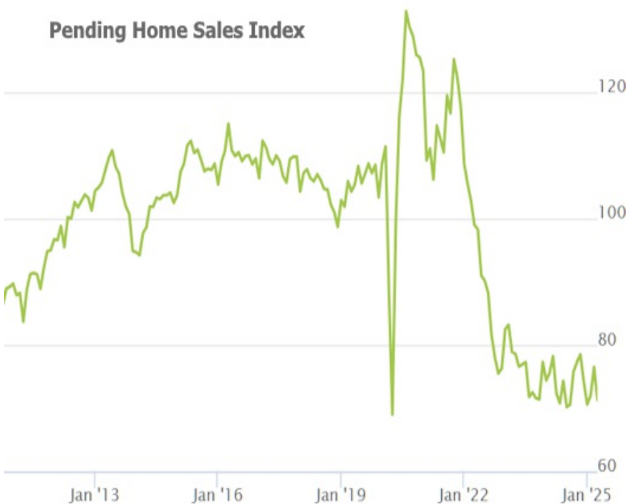
Pending Home Sales Index

Lastly on the housing data front, Case Shiller and FHFA released March home price data. Here too, the charts are mostly drifting sideways near recent lows. This is actually good news because as long as the lines are over zero, home prices continue moving higher.