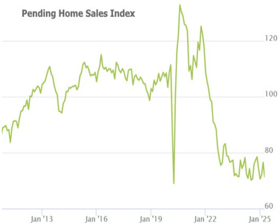
Pending Home Sales Index

Lastly on the housing data front, Case Shiller and FHFA released March home price data. Here too, the charts are mostly drifting sideways near recent lows. This is actually good news because as long as the lines are over zero, home prices continue moving higher.