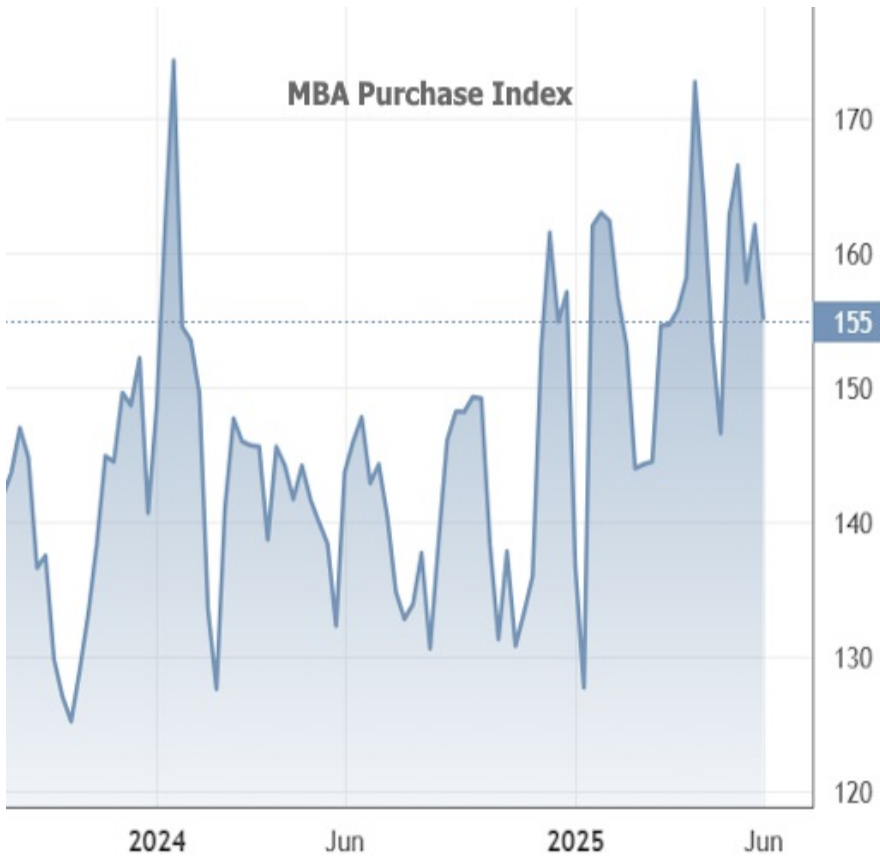
MBA Purchase Index