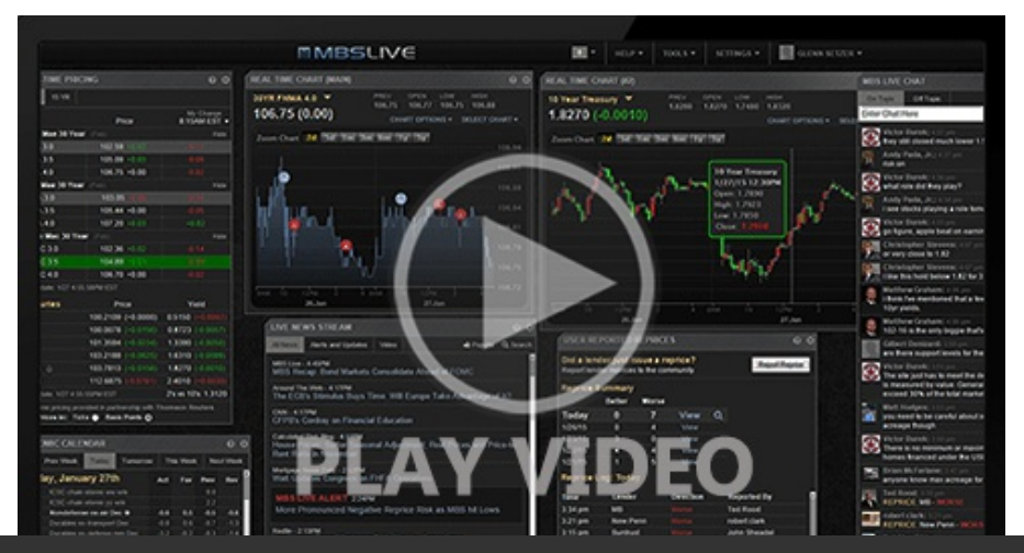
© MBS Live, LLC. All rights reserved. This newsletter is a service of MBS Live.

It's not necessarily a fun fact to face, but today's bond market sell-off was a perfectly logical reaction to the modest beat in NFP. But wait, what about the negative revisions?! Yes, it's still a logical reaction. Reasons for this are exhaustively discussed in today's video, but the short version is as follows. Wednesday's rally was largely about Wednesday's data carrying anecdotal implications for Friday's jobs report. When Friday's jobs report didn't deliver the goods, the rally was erased. Revisions didn't matter because last month's NFP was a big beat in and of itself and only revised to levels that were still higher than today's headline. Bottom line: NFP looks sideways at decent levels--not at all worthy of the concern suggested by Wednesday's reports and other generally weaker data over the past week.