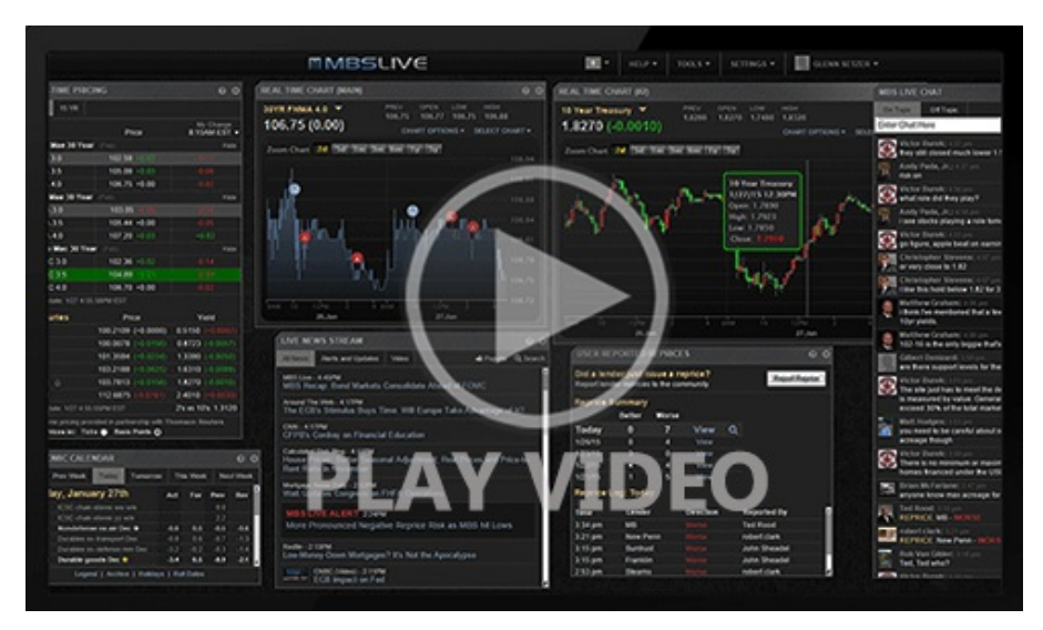
Watch the Video