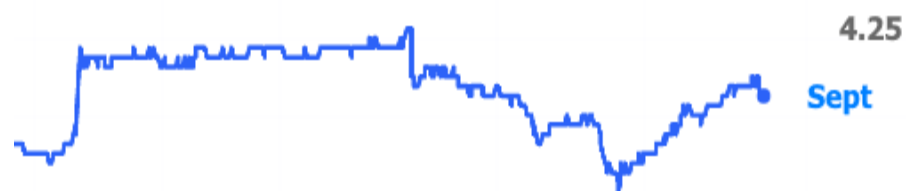
Fed Funds Rate expectations by meeting month