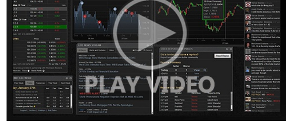
Watch the Video