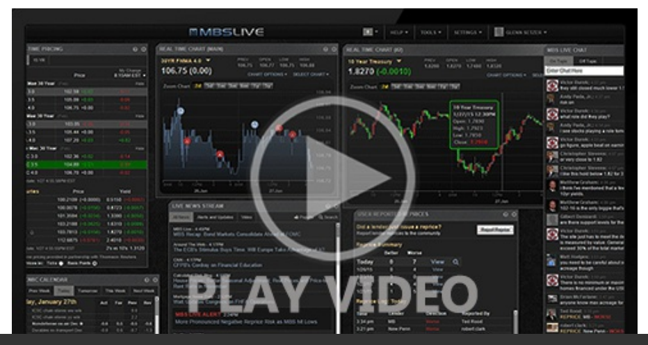
\ensuremath{\mathbb{C}} MBS Live, LLC. All rights reserved. This newsletter is a service of MBS Live.

Sometimes bonds rally or sell-off for no apparent reason, or at least for no reason that can be easily proven. That's been the case on each of the past two sessions with 30yr yields moving almost 10bps higher between the two of them. Geopolitical motivations have been nonexistent despite some efforts to link oil price concerns to bond weakness (not a solid thesis right now). Fiscal concerns may be having some small effect behind the scenes, but they're hard to substantiate based on the available headlines. The easiest approach would be to continue to classify the market as rangebound, in which case a pull-back makes sense given the lower yields seen last Thursday--especially with bigger ticket data/events over the next two days.