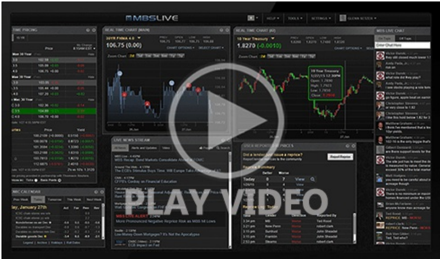
Watch the Video

Bonds lost some ground after this morning's economic data, arguably in response to the Retail Sales control group beating its forecast. Higher-than-expected import prices could also have played a supporting role, but the selling was too modest to worry about perfectly allocating the blame. It was also erased by an afternoon rally that was best explained by general risk-off vibes surrounding geopolitical headlines. Here too, we're not seeing anything too compelling in terms of trading justification. The best bet on that front would be Wednesday's dot plot from the Fed (the chart showing each Fed member's rate outlook over the next few years). That will be released at 2pm with the "no cut" announcement.