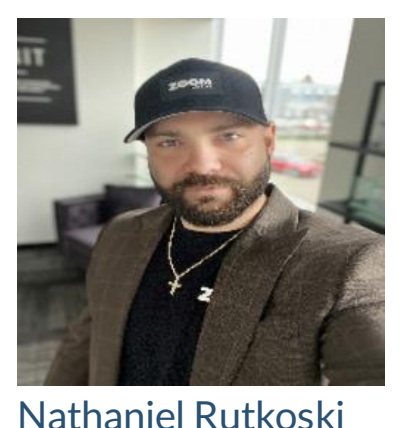
Mortgage Broker, Zoom Loans

www.ZMLoans.com M: (408) 767-6311 2140 W Grantline Rd Tracy CA 95376 NMLS# 356590