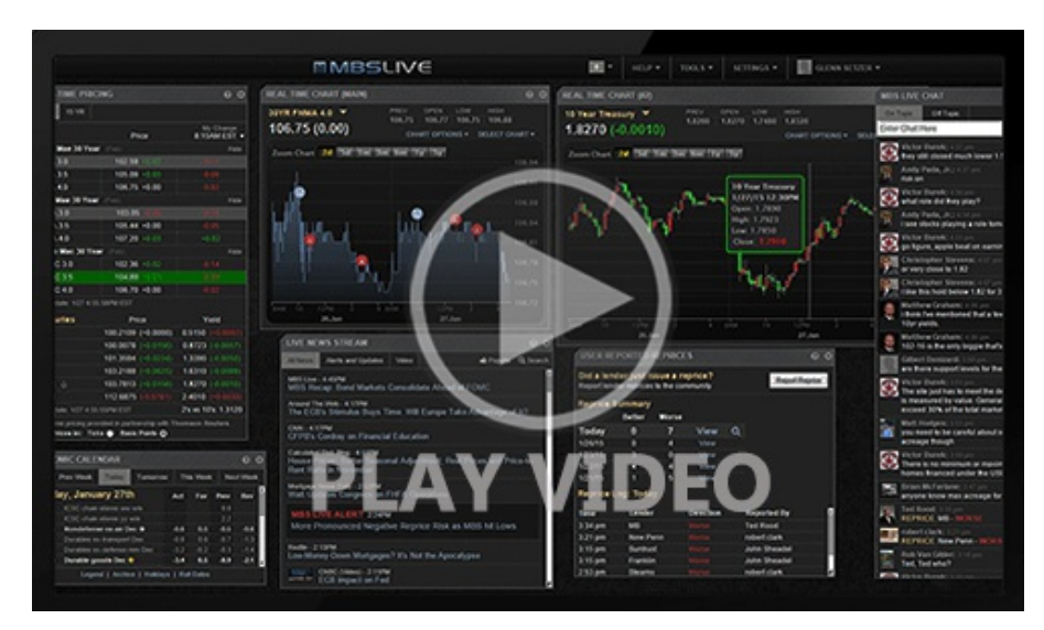
Watch the Video

The present week didn't manage to offer nearly as much excitement as the previous few examples, but that's not necessarily a bad thing considering yields/rates are near the lower boundary of their recent ranges. Today looked like it may have been a higher rate day at the start of the session, but bonds arrested the selling trend and reversed course after dovish comments from Fed's Waller. Europe's close was also beneficial for US bonds, helping us get all the way back into modestly stronger territory before trading levels flat-lined into the U.S. close.