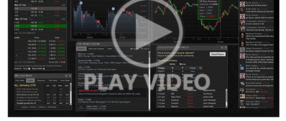
Watch the Video