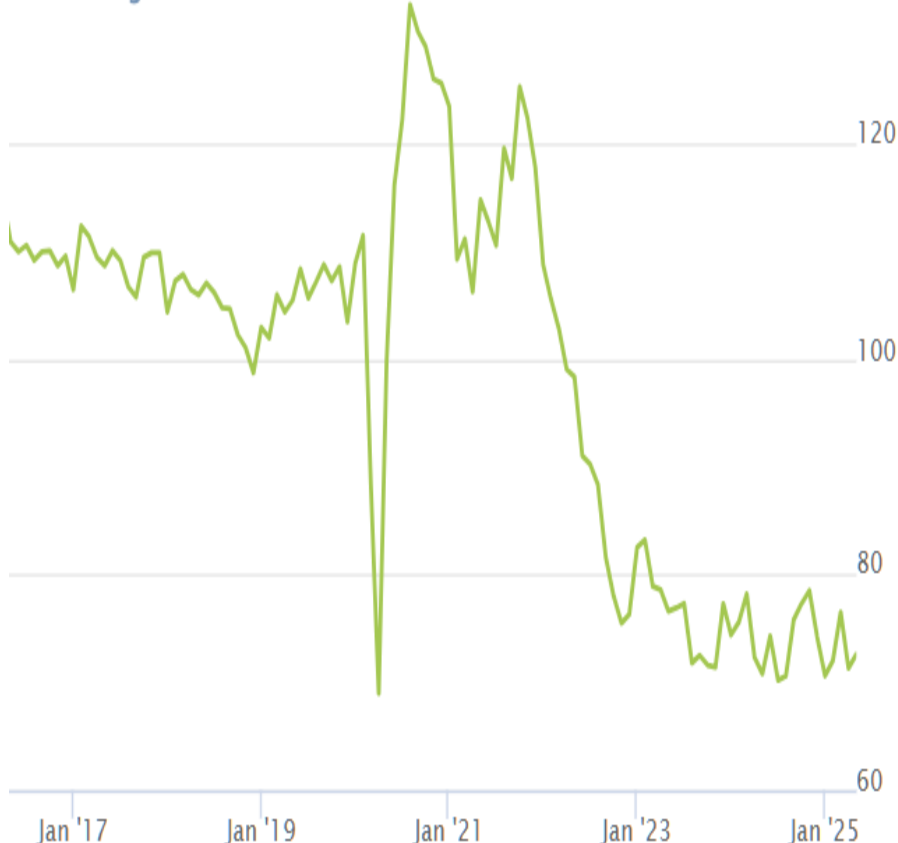
Pending Home Sales Index