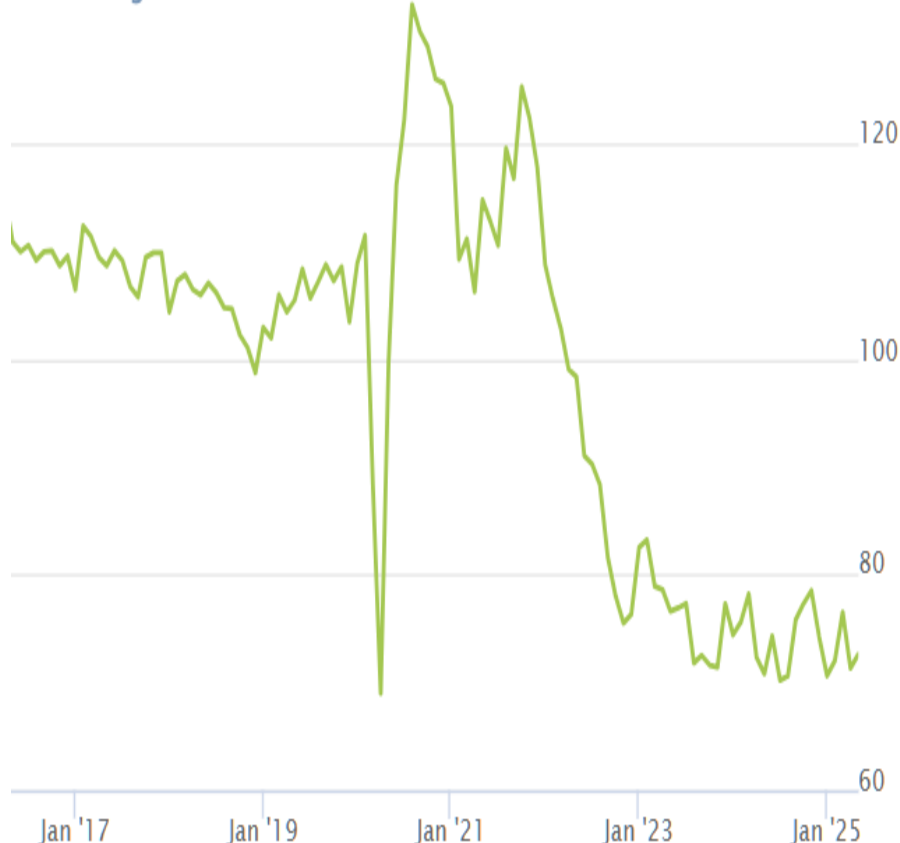
Pending Home Sales Index

Zooming out, contract activity remains stuck in a narrow band. The index hasn't been above 80 since the summer of 2022 and continues to reflect a sluggish, rate-constrained housing market.