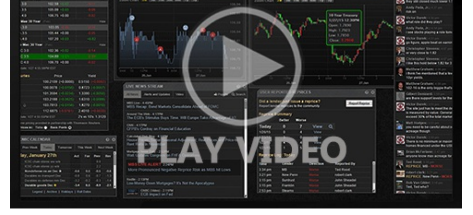
Watch the Video