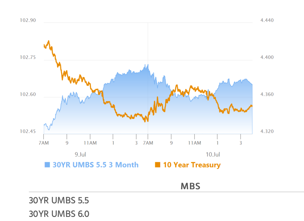
This newsletter is a service of MBS Live.