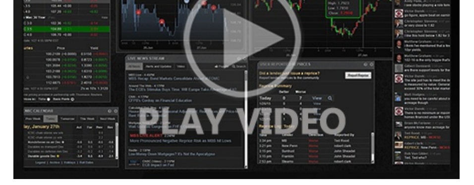
Watch the Video