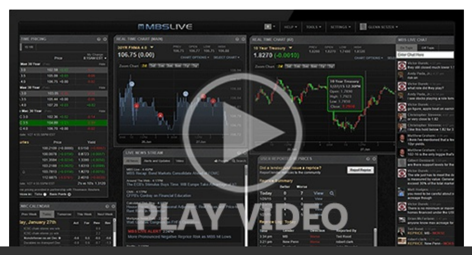
© MBS Live, LLC. All rights reserved. This newsletter is a service of MBS Live.

Stocks sold off quickly in the overnight session in response to the announcement of 35% tariffs on Canada. Bonds view such news as a double edged sword, but also drifted into weaker and weaker territory as the day progressed. Given that yields remained inside the week's range, we're more inclined to view this as an acceptable sideways drift ahead of big ticket data event: Tuesday's CPI report. It goes without saying that some of the market will have to be surprised by the outcome which either will or will not show that tariffs have begun impacted the data in a significant way. The farther from forecast, the larger the surprise and the potential bond market reaction. In that light, Friday's weakness could be viewed as a move to the sidelines ahead of the forthcoming revelations.