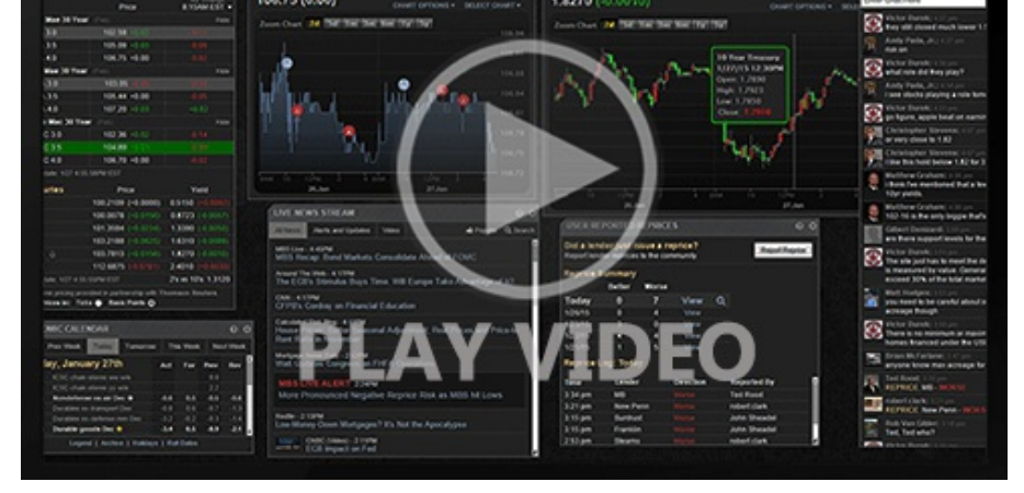
Watch the Video