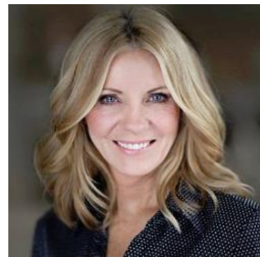
Christina "Demo" Realtor

Managing Partner, Real Estate Company, LLC.