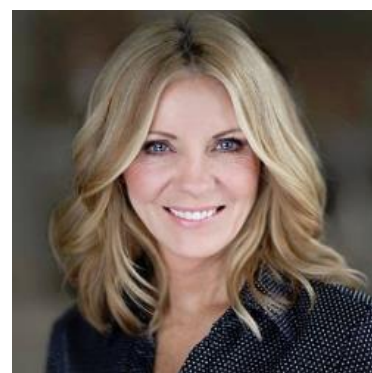
Christina "Demo" Realtor

Managing Partner, Real Estate Company, LLC.