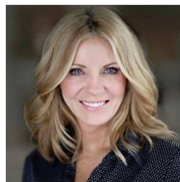
Christina "Demo" Realtor Managing Partner, Real Estate Company, LLC.

mbslive.net P: (704) 555-1212 M: (980) 555-1212 social+test@mbslive.net 12954 S. Broad St. Charlotte NC 28031