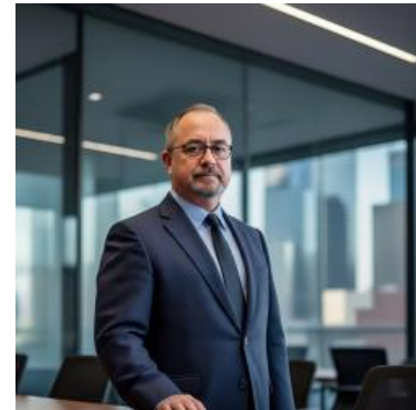
Amer Samman Mortgage Seven LLC

In simpler terms, oil is a key input in the cost of transporting almost any physical good almost anywhere in the world. If war in Iran is pushing oil prices abruptly higher, the bond market is forced to anticipate higher inflation in the future. The result: higher interest rates today.