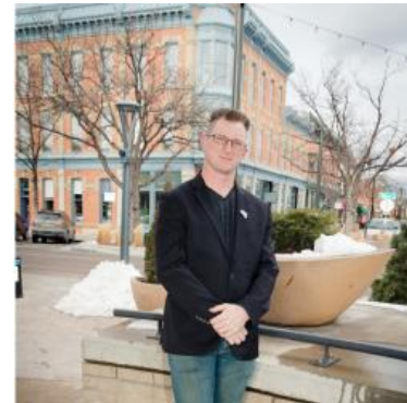
Marc Erickson Mortgage Guide, Excel Financial Group, LLC

The headline index rose one point to 38 , following a small upward revision to February's reading. While the increase marks a modest improvement, builder sentiment remains well below the breakeven level of 50 that separates positive from negative market conditions.