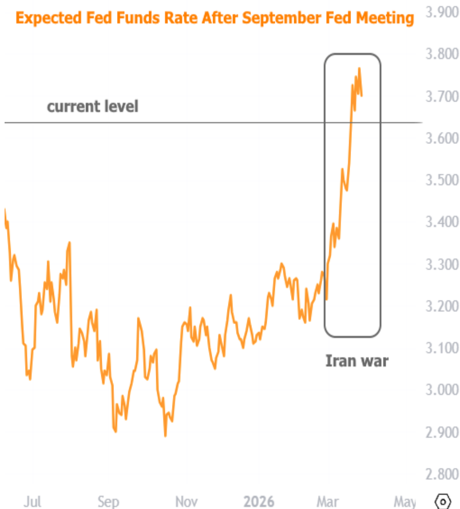
Expected Fed Funds Rate After September Fed Meeting

Rising inflation expectations go hand in hand with higher interest rates and lower odds of Fed rate cuts. The following chart shows how Fed Funds Rate expectations have changed for the September Fed meeting.