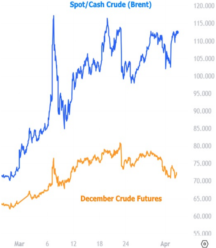
Spot/Cash Crude (Brent)

This can help us resolve some of the moments that seem counterintuitive with respect to movement in the bond market. Using Treasury yields as a barometer for interest rate movement, let's take a look at rates compared to current oil prices to see the apparent discrepancy.