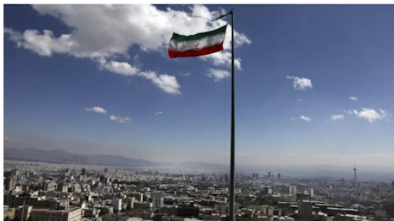
The Iranian flag in Tehran. File photo.

RIA Novosti: Iran expects a breakthrough in talks on organizing a meeting with the US