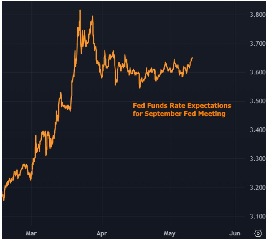
Fed Funds Rate Expectations for September Fed Meeting