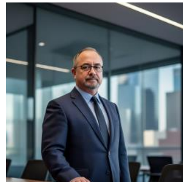
Amer Samman Mortgage Seven LLC