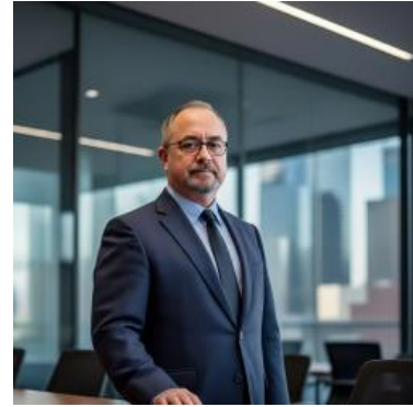
Amer Samman Mortgage Seven LLC