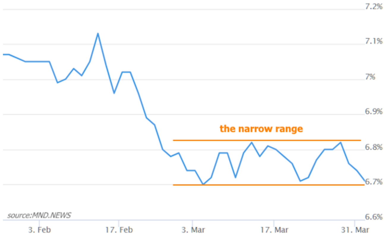
30yr Fixed Mortgage Rate Index

Today's victory wasn't necessarily a given. It relied on the bond market's reaction to today's economic data. Bonds drive rates, and econ data can be a key motivation for bonds. Weaker data tends to help bonds improve, thus pushing rates lower.