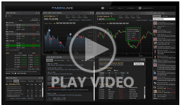
A Little Early Excitement